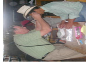
Fit the glasses